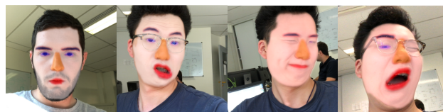
FIGURE 1 – The visual results of our method on iPhone. Our method is robust to extreme expressions and poses

The goal of face parsing is to classify every pixel of an image into a category of facial components. Detecting dif-